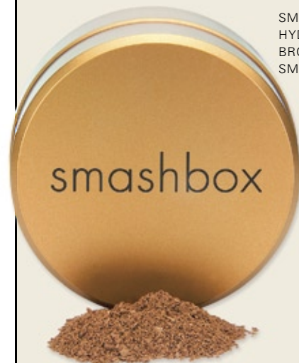
SMASHBOX HALO HYDRATING PERFECTING BRONZER ($45, AT SMASHBOX COUNTERS)