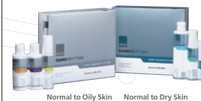
Normal to Oily Skin Normal to Dry Skin